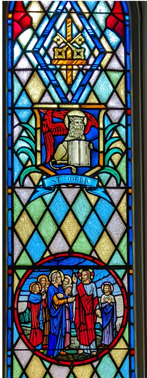
Erwin Chapel - St. Mark's Window

www.stmarksnewbritain.org www.facebook.com/saintmarksnb